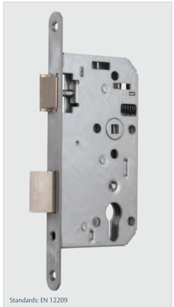
Standards: EN 12209