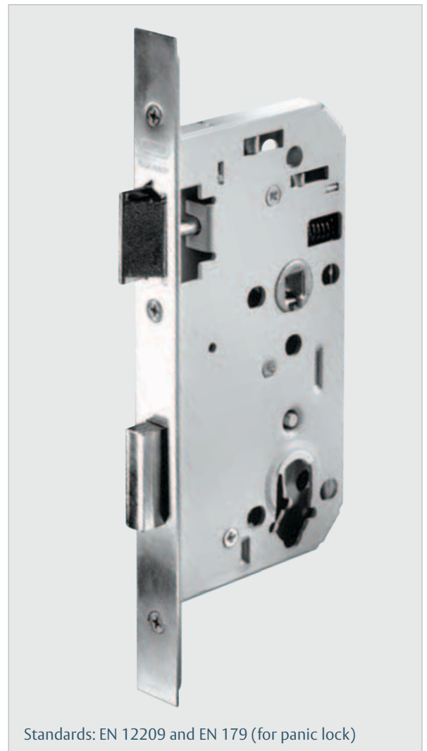
Standards: EN 12209 and EN 179 (for panic lock)